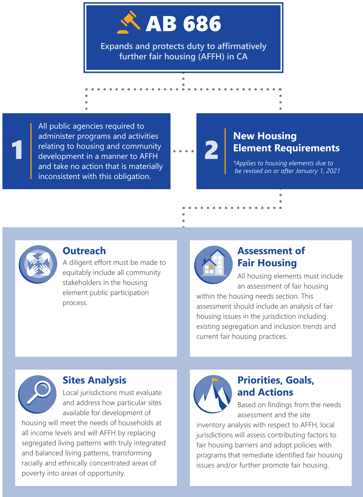
Chart 1: Summary of AB 686 Requirements